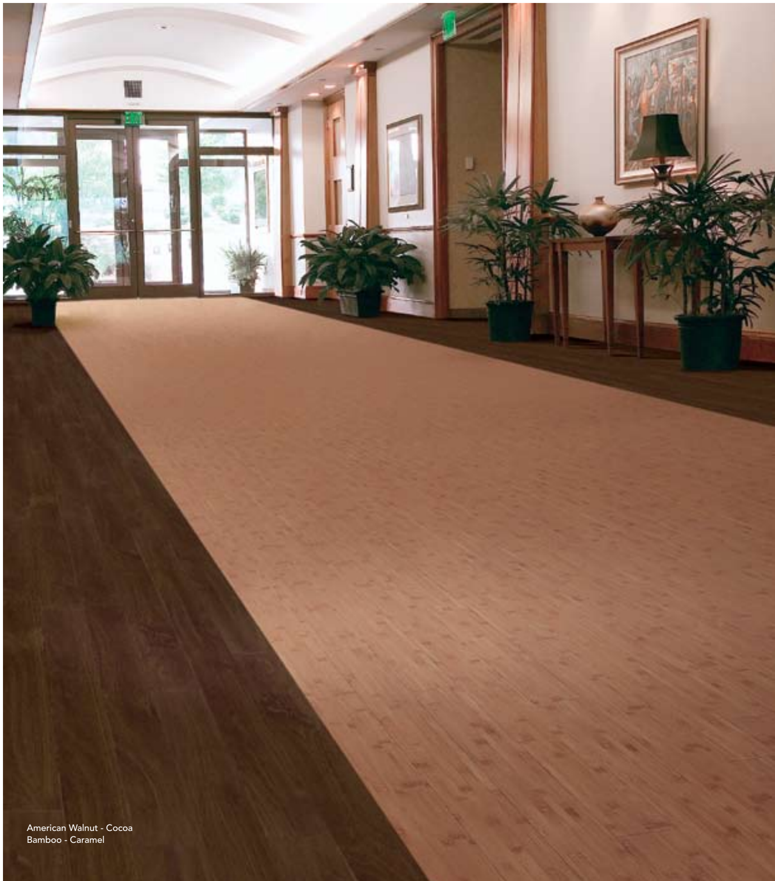
American Walnut - Cocoa Bamboo - Caramel