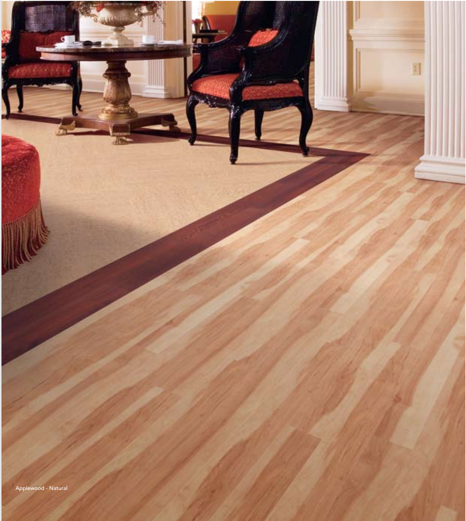
Applewood - Natural