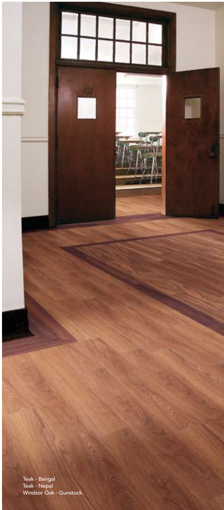
Teak - Bengal Teak - Nepal Windsor Oak - Gunstock