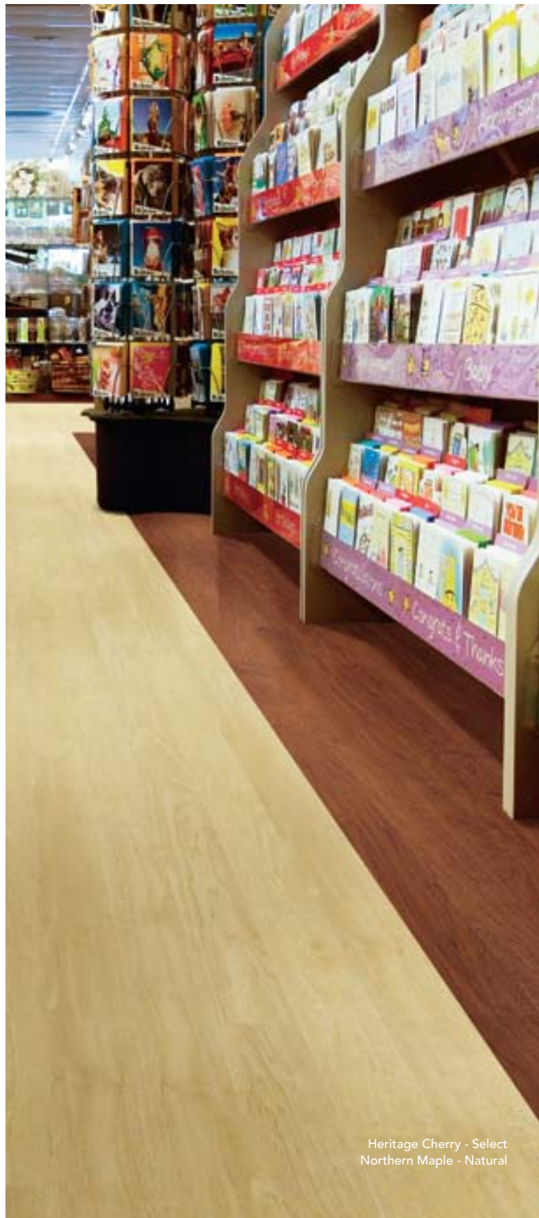
Heritage Cherry - Select Northern Maple - Natural