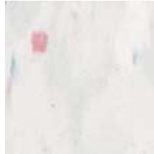
401 white multiflec