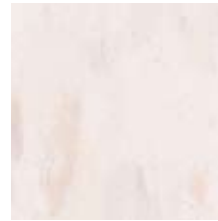
417 cream tones