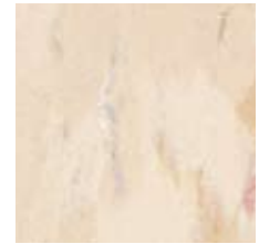
419 tweed medley