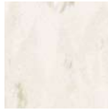
415 ecru multiflec