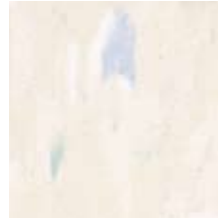
407 beige multiflec