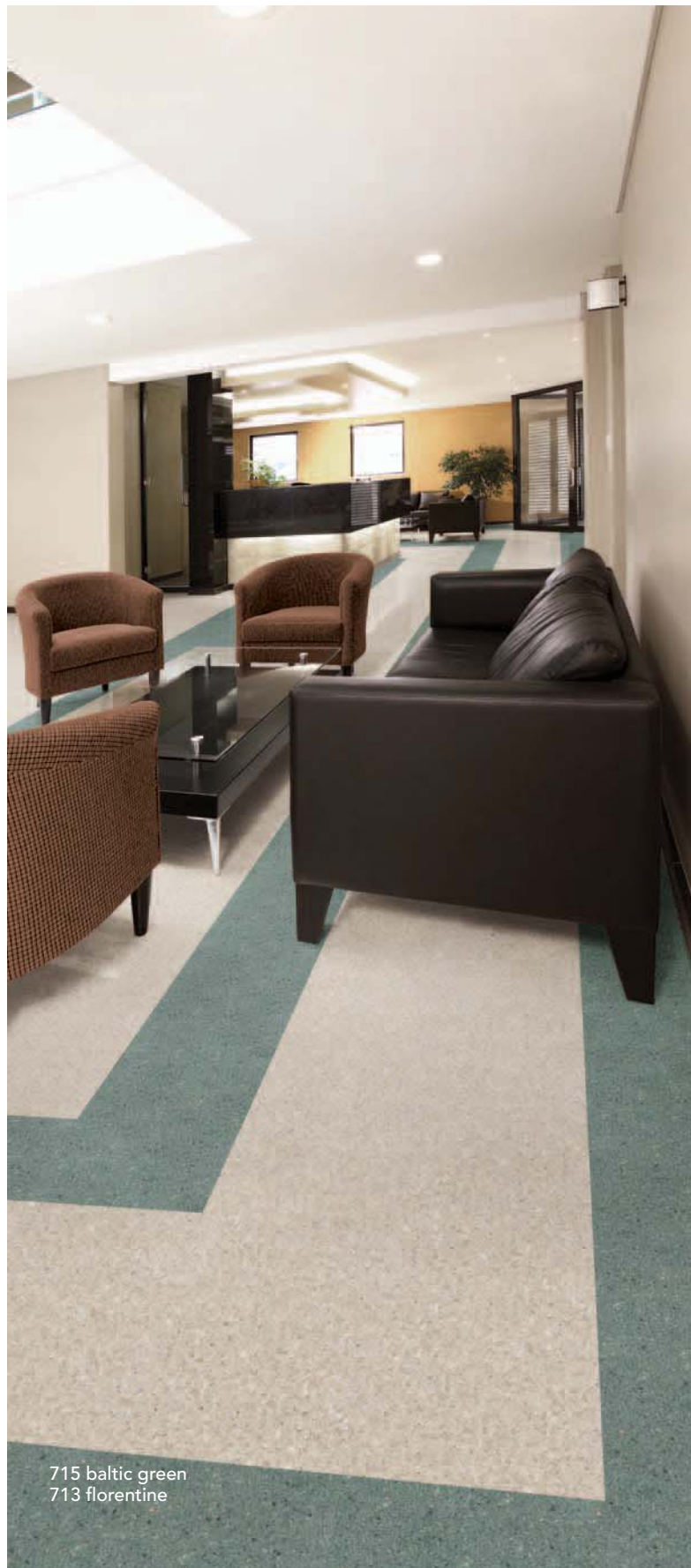
715 baltic green 713 florentine